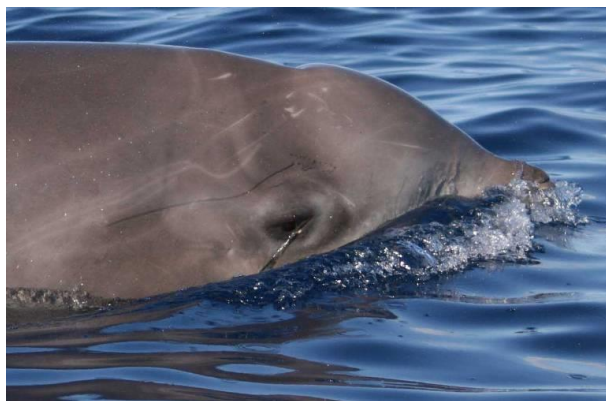
Figure 3: Sign of interaction with fisheries, a hook from a long-line in the external ocular region of a Cuvier’s beaked whale off El Hierro, in the Canary Islands.

Bycatch of beaked whales has been documented in different fisheries and geographical areas, from the Mediterranean to the Pacific, involving mainly Cuvier’s beaked whales but also species of genus Mesoplodon and unidentified beaked whales (di Natale 1994; Carretta et al. 2008). Fourteen Cuvier’s beaked whales were reported as having been captured intentionally between 1972 and 1982 (11 in French waters and 3 in Spanish waters), all shot and 1 also harpooned (Northridge 1984).