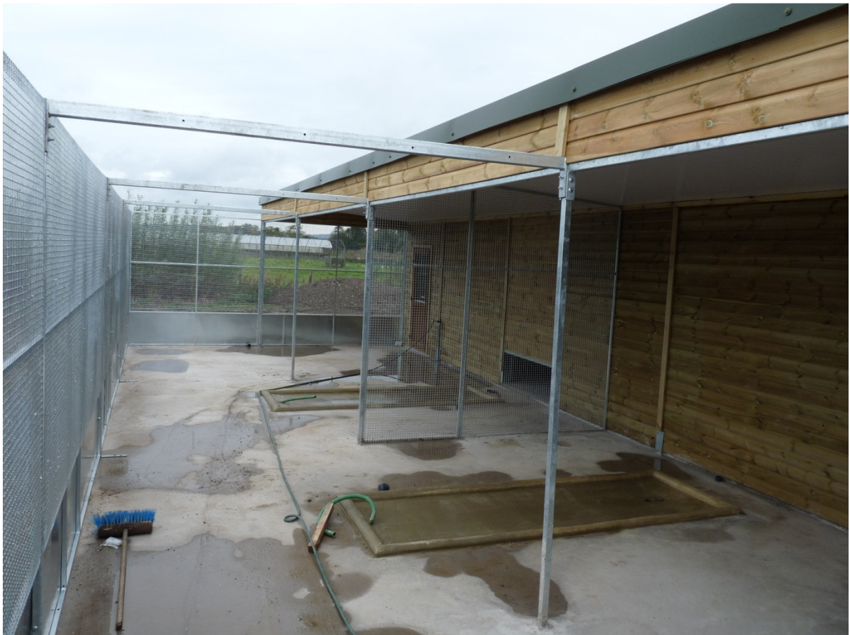
Spoon-billed Sandpiper winter accommodation under construction at Slimbridge.

After a further period of quarantine, the Spoon-billed Sandpipers will be moved into new purpose built winter accommodation at Slimbridge.