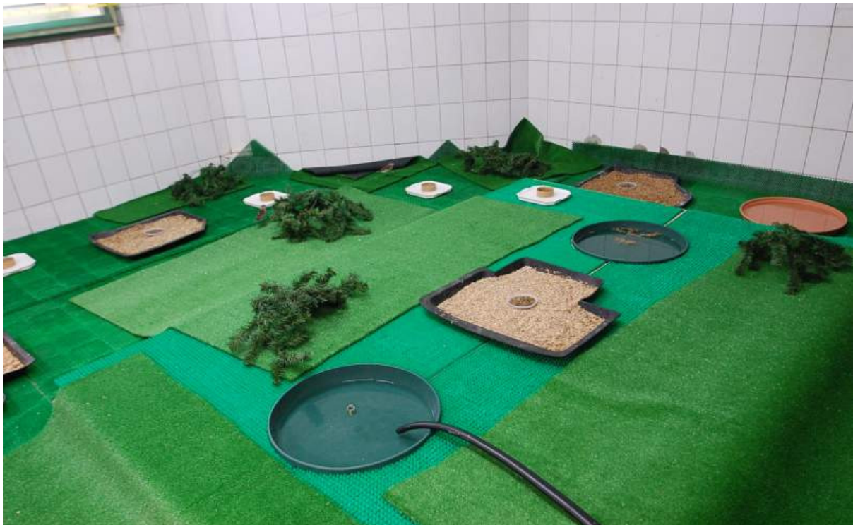
Quarantine facility in Moscow Zoo.

Unfortunately one full grown chick died on 9 August and the remaining 16 chicks were transported to Moscow Zoo on 18 August where they underwent a period of quarantine. Two chicks died in quarantine. The remaining 14 chicks were flown to the UK on 13 October.