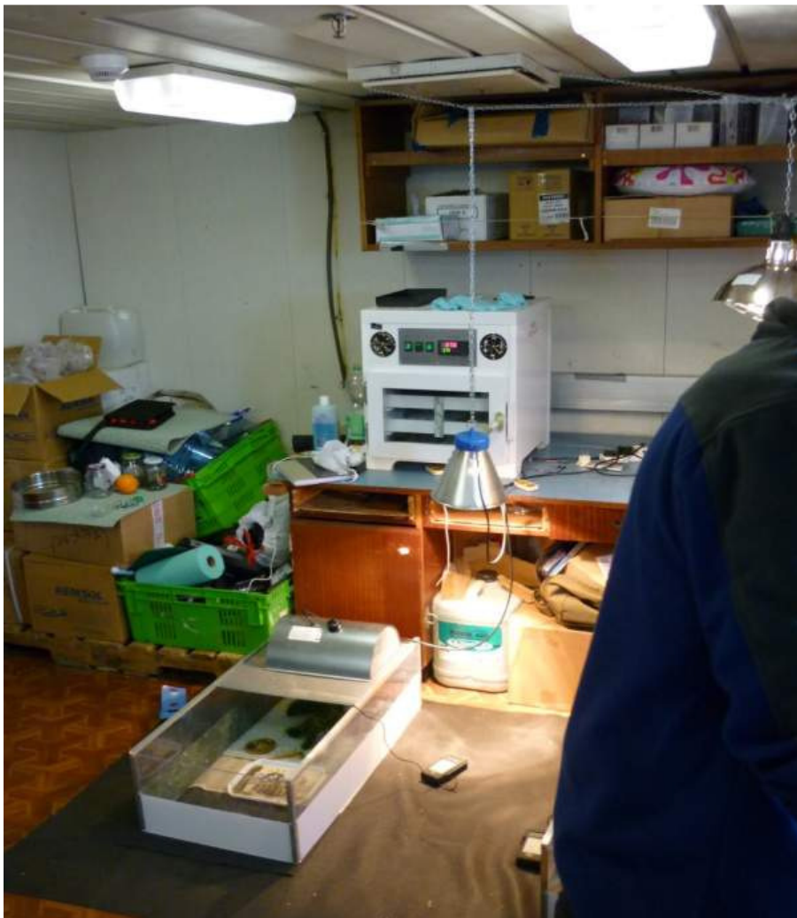
Eggs and chicks aboard the Spirit of Enderby.

The eight chicks and 12 eggs were moved onto the boat on 7 July to travel to Anadyr where the chicks would be reared before being flown to Moscow. On the journey a further nine eggs hatched.