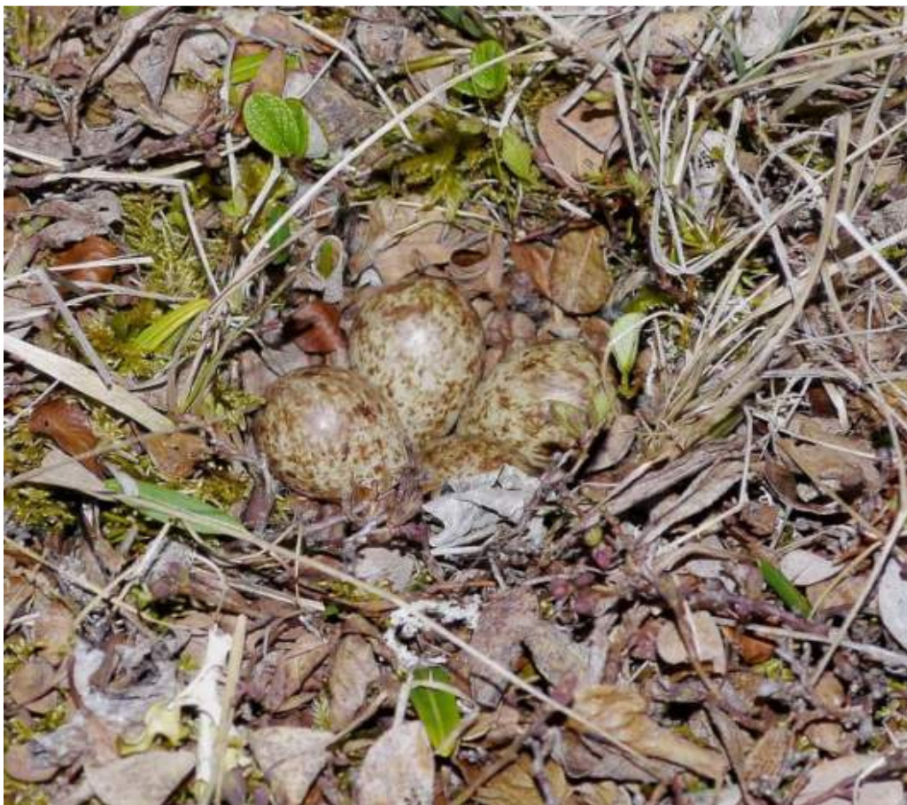
The first clutch of Spoon-billed Sandpiper eggs.

However, fortunes changed with the first eggs were collected on 19 June and the last on 3 July giving a total of 20, ranging from 0-1 days to 18 days incubated.