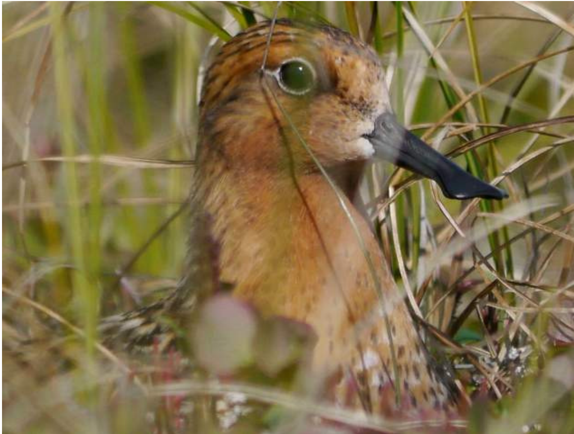
Incubating female Spoon-billed Sandpiper.

However, fortunes changed with the first eggs were collected on 19 June and the last on 3 July giving a total of 20, ranging from 0-1 days to 18 days incubated.