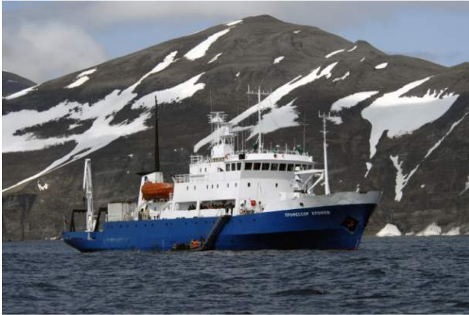
The Spirit of Enderby.

The team were transported from Meinypilgyno to Anadyr on the “Spirit of Enderby” courtesy of the Heritage Expeditions tour company.