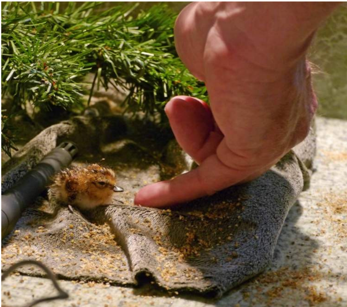
The same chick one day later.