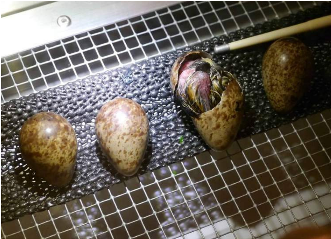
The first ever Spoon-billed Sandpiper to be hatched in captivity.

The first clutch hatched on 5 July and the second two days later.