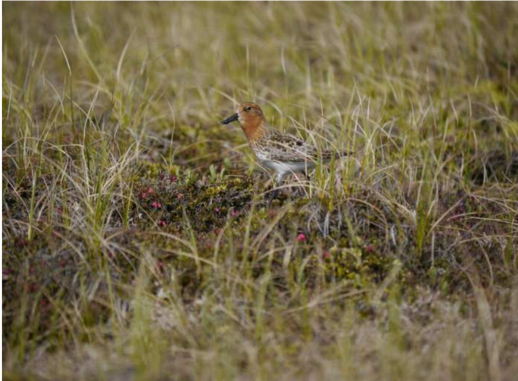
Male Spoon-billed Sandpiper on territory.

The search area was about 100 square miles – with nine team members walking about 10 miles each day. The first bird - a singing male - was heard and seen on 2 June. Over the next few days, more males were located on territories. After a male was located the nest searching team backed off and re-visited two days later to check whether males were paired. Usually they were and copulation was even observed.