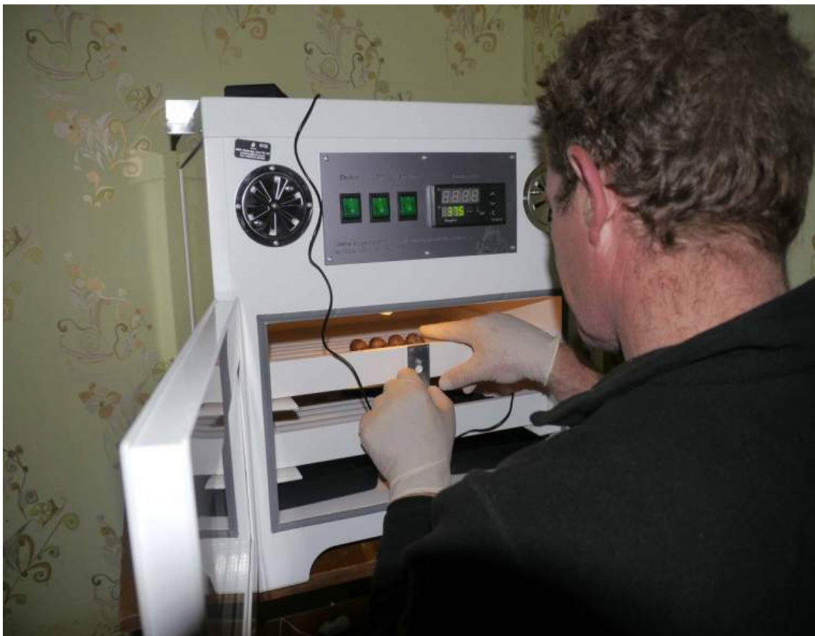
Placing Spoon-billed Sandpiper eggs in an incubator.