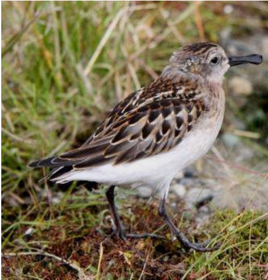
Fledged juvenile Spoon-billed Sandpiper in Anadyr.

Unfortunately one full grown chick died on 9 August and the remaining 16 chicks were transported to Moscow Zoo on 18 August where they underwent a period of quarantine. Two chicks died in quarantine. The remaining 14 chicks were flown to the UK on 13 October.