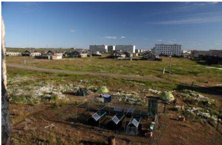
Spoon-billed Sandpiper rearing facility in Anadyr.

One egg failed to hatch and two chicks died without feeding. At 5-10 days old the 17 chicks were transferred to a rearing facility on the tundra next to an ex-army base.