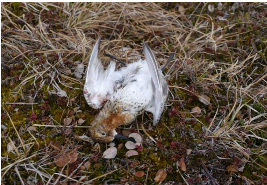
Predated nesting female Spoon-billed Sandpiper.

Early hopes were dashed when meltwater flooded out the earliest territories, and on 16 June, the team again started looking for nests in locations where paired birds had been observed. However the first nest they came across had been predated, along with the nesting female.