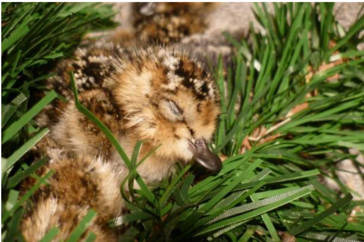
Spoon-billed Sandpiper chicks aboard the Spirit of Enderby.