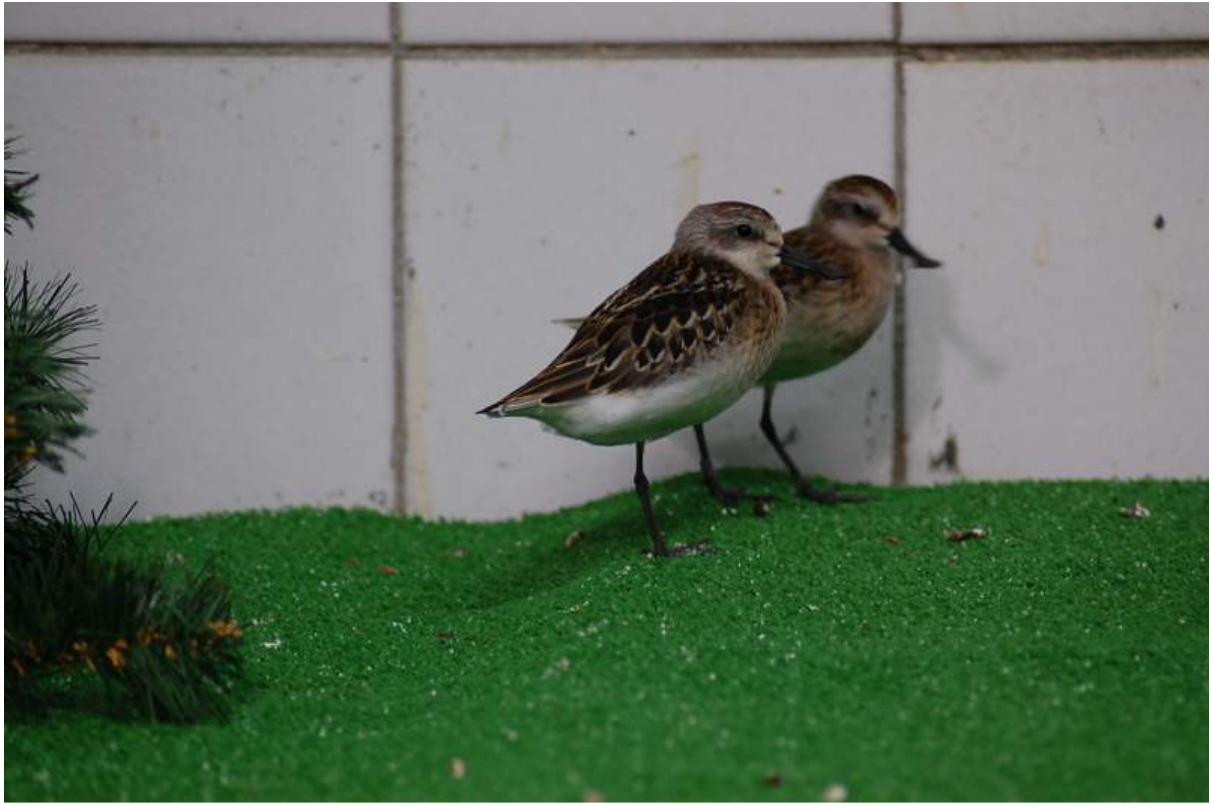
Juvenile Spoon-billed Sandpipers in quarantine at Moscow Zoo.