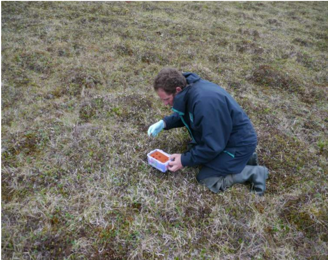
Collecting the last clutch of Spoon-billed Sandpiper eggs.

Eggs were collected from the field and artificially incubated.